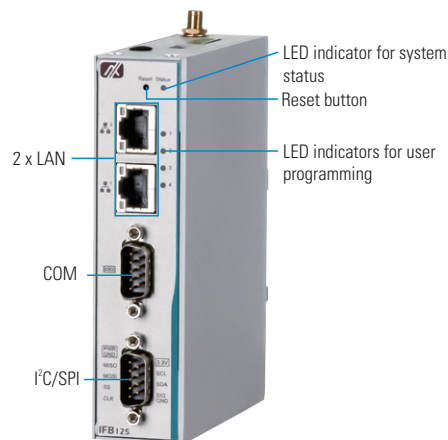
▲ Front view